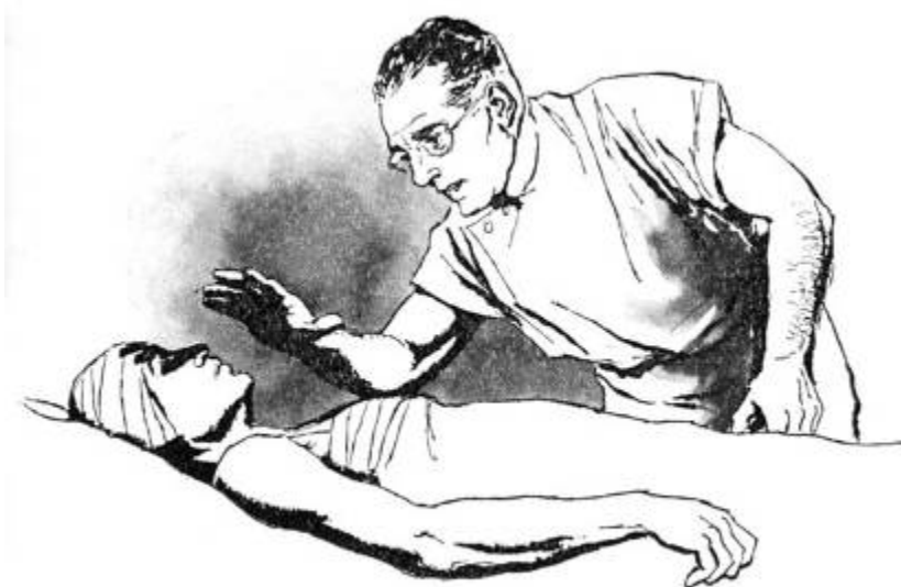
The doctor passed his hand quickly over it, and then he exclaimed, "There's sight in it!"

She said, "I've never seen anything like this in my life." She walked around to the foot of the bed, and again he yawned.